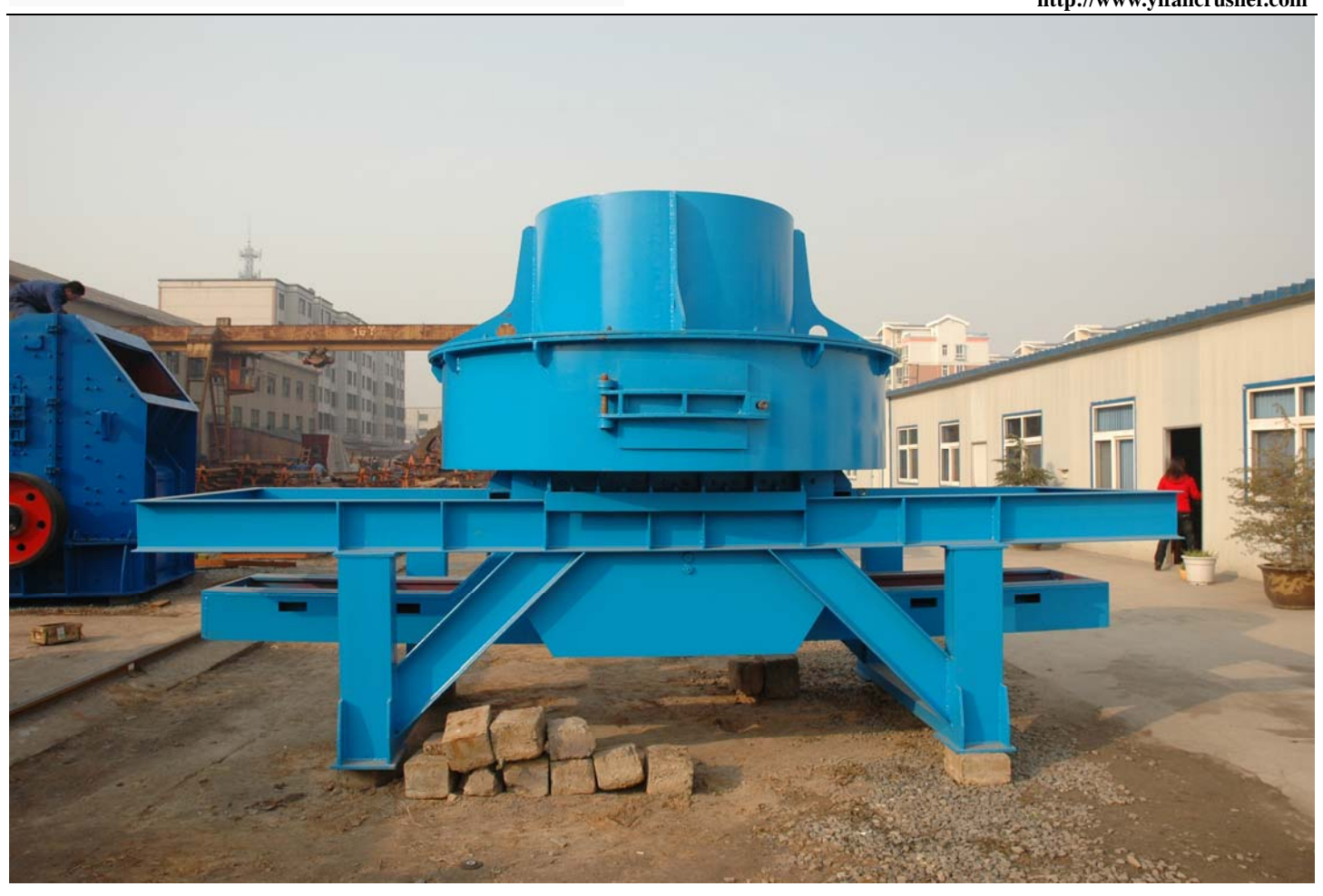
Real picture of conecrusher